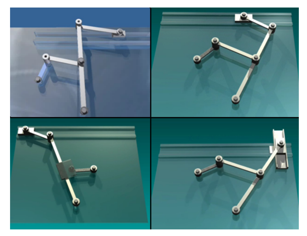
Fig. 3. Models for the virtual laboratory works on the "Theory of mechanisms and machines" course