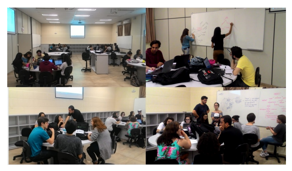
Fig. 4. SATC Active Learning room.

An important aspect to implement the PBL is related to classroom layout, which allow to foster collaboration and interactive learning. Because of that, we designed our own active learning room (Fig. 4) We have whiteboards for students to share and express their ideas. We also have a mobile camera that allows students to showcase their work by streaming in the big screens.