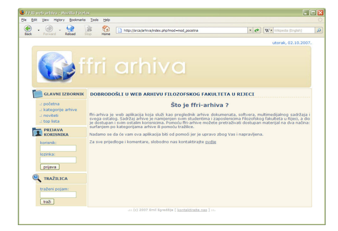
Figure 2. Web application homepage

The technologies used for GUI are standards for web application interface design: HTML, CSS (Cascading Style Sheets), Javascript. All the components are glued together using design templates so newly created design can be easily imported in the system. Web application homepage is shown in Figure 2, and content information and download link are presented in Figure 3.