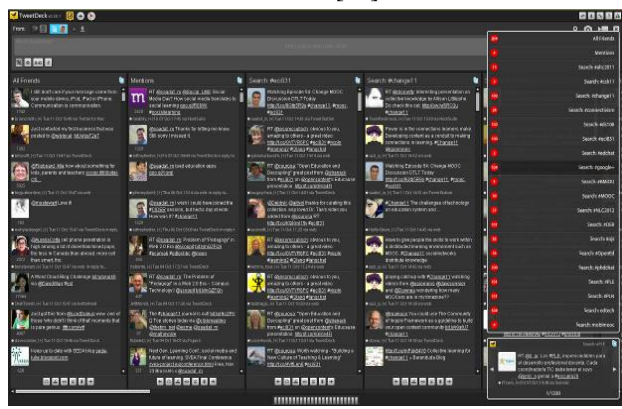
Figure 3. TweetDeck desktop application which shows notifications and latest updates

updating space with numerous activities by many users, serendipty is likely to accur that can open up new ways of discovery for learner. Kop [27] in a study on MOOCs found that receiving re-tweets heightens serendipity because these tweets would be provided by contacts of contacts, yet still be reasonably close to the aggregator. Fig 4. demonstrates the number of tweets, retweets, and replies in one of the MOOCs of course related events and resources. These tweets have been what participants found interesting which can also contained serendipitous information in associated links [18].