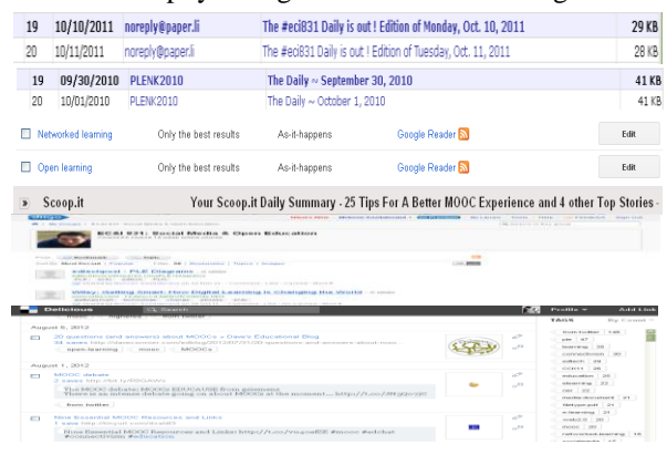
Figure 2. Aggregation and curation of materials in different tools

gRSSHopper mediated by one of the course facilitators and sent everyday to the participants' emails (shown in Fig 2.). It was collecting all materials regarding the course which used the course #hashtag whether in Twitter, blogs, or wikis. In another course Paper.li was used to syndicate contents using #hash-tags or keywords to curate the content and deliver them to the participants in a daily base. There were many resources related to the subjects of the course in Diigo and Delicious that were collected and shared by the course participants and facilitators. All these ways of content aggregation and sharing provided participants with such valuable unexplored unanticipated resources that they may not have been intending to use. With such an abundance of information the flow serendipity emerges and fortifies learning.