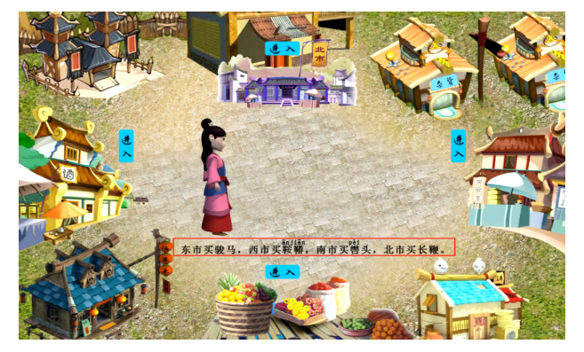
Figure 3. Mulan is shopping in the market