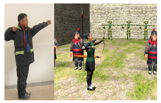
Figure 4. Archery training on motion sensing