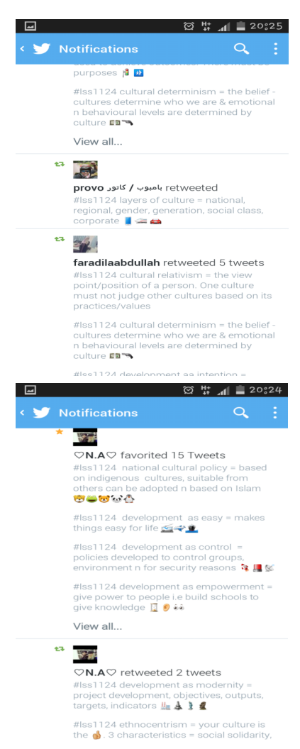
Figure 2. Screenshots of tweets and retweets