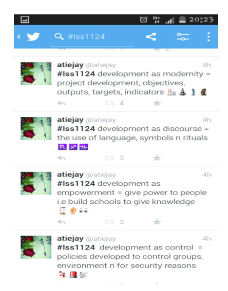
Figure 3. Another screenshot of tweets and retweets

their revision. What surprises the researcher is that the students were able to relate the tweets to relevant examples when needed during classroom learning. This suggests that students had understood the concepts well and that in so doing, they are able to link relevant examples to further explain the concepts.