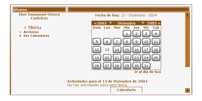
Figure 6. Student Interface

3. Students or Tutees: are students who are enrolled in the College of Telematics or, in the future, different schools and colleges of the University. Students can be provided privileges to create chat rooms or forums with prior authorization of the Administrator. Students who are registered in the system may enter the different chats or forums using their real name or an alias, depending on the degree of confidentiality required. The students, however, do not have access to any of the information contained in the different databases.