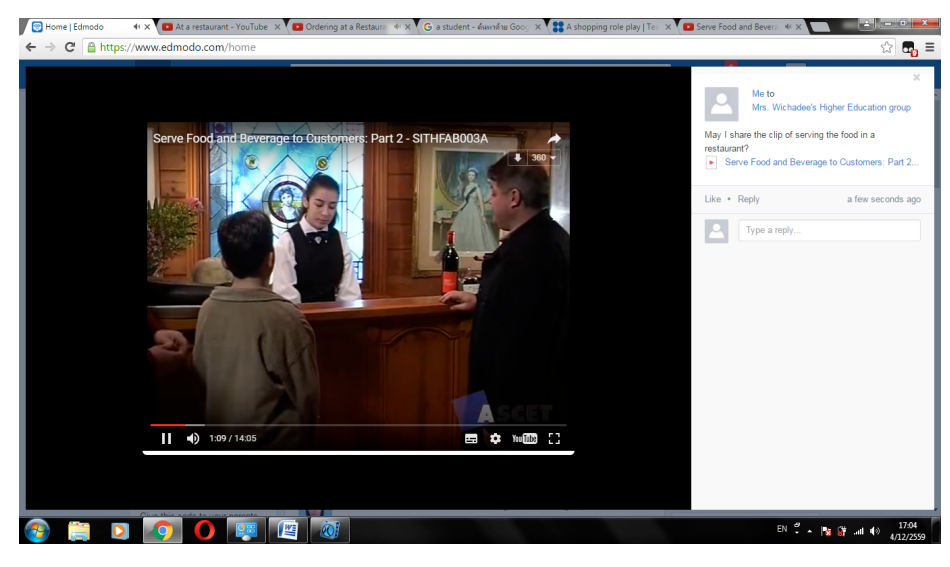
Fig. 3. Sample useful video clip on student's Edmodo page