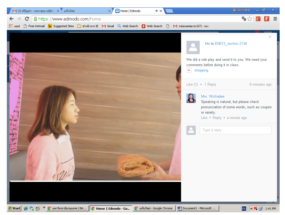
Fig. 4. Screenshot of role play clip posted by students