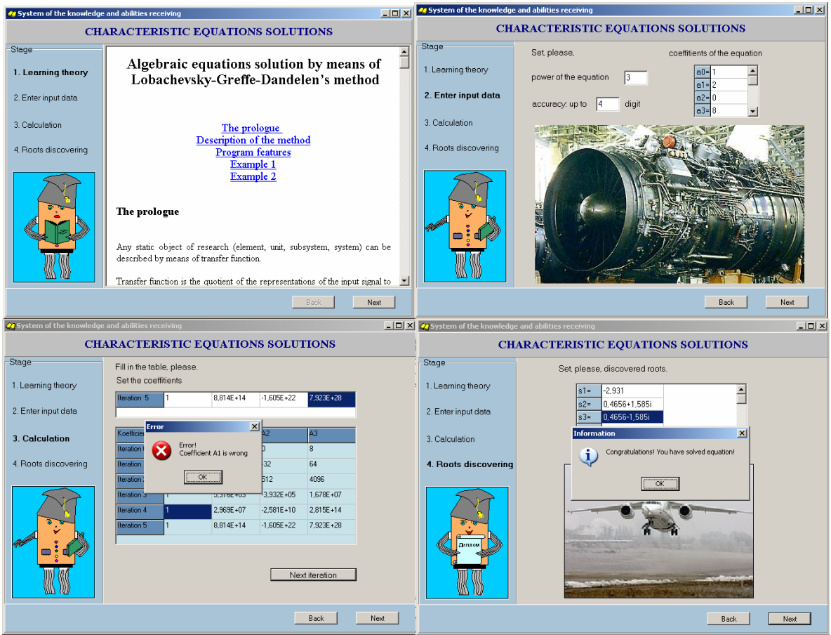
Figure 2. Intelligent tutor system screenshots