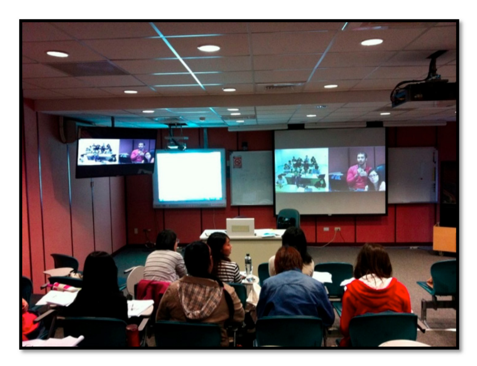
Fig. 2. A photo of the videoconferencing group.