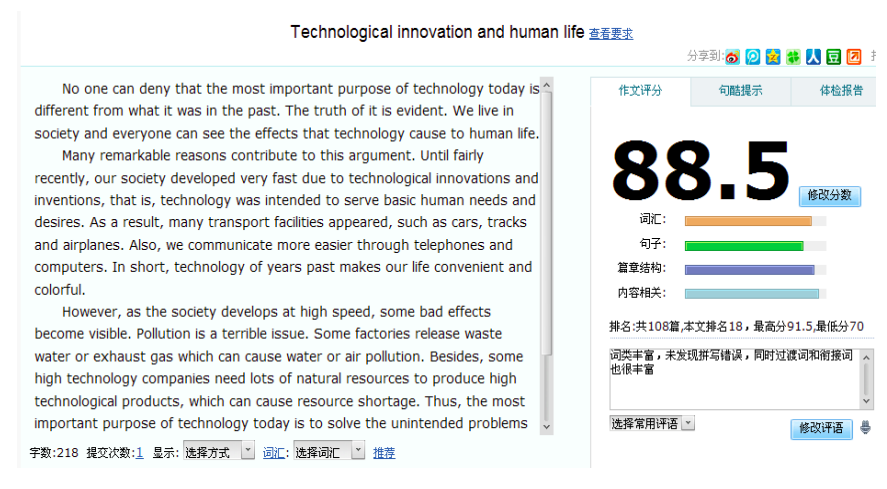
Fig. 1. The Screenshot of Jukuu

can correct their articles by using the feedback functions of Jukuu [15]. Figure 1 is the screenshot of Jukuu feedbacks on student compositions