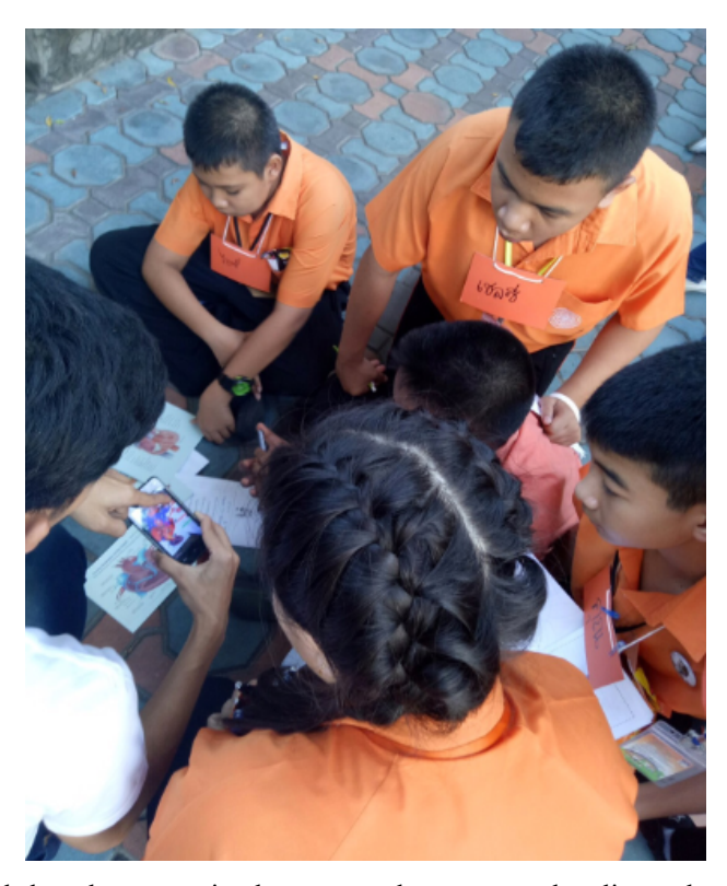
Fig. 4. Workshop demonstrating how to use the augmented reality tool to teach about the heart