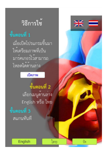
Fig. 1. Interface of the augmented reality for teaching Thai students about the human heart

Based on the design of the augmented reality tool for teaching about the heart, the information about the heart components, the heartbeat, and the blood circulation in each chamber were used for constructing the model of the augmented reality tool to teach heart anatomy. Subsequently, there was a construction of the contents promoting memorization skills by linking pictures together into the model of a heart. The users could use the augmented reality via smartphones or tablets with a scanning application to scan the heart pictures for virtual memorization of the structure, the heartbeat in each chamber, the blood circulation, and other functions of each chamber. The subjects had a choice in displaying the Thai or English language. Augmented Reality displays the blood flow with each heartbeat in each chamber as shown Figure 1 to Figure 3.