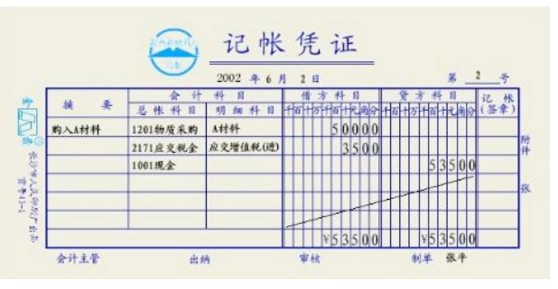
Figure 3. Accounting document generation