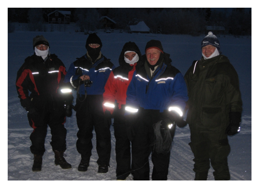
Fig. 1. First meeting of DAETE project, Jarisjervi, Finland.

The innovative strategies of DAETE consisted in addressing the different approaches in the European Union (EU) and USA about quality assurance of CEE allowing exchange of experiences and results of case studies. This tactic allowed a reciprocal understanding of the benefits of the methods that can be used by the engineering educational and training community in the EU and USA. The added value of the proposed transatlantic cooperation can be measured under two perspectives. The first perspective is related to sharing the experiences of the partners of the EU and USA concerning the quality assessment of education and training in CEE. In effect, the environments that framed the progress of this area have been different in these two regions. In Europe the research and development about quality evaluation of CEE has been based on joint projects supported by the EU funding. In the USA the quality assessment of CEE centres has been developed using market analysis indexes.