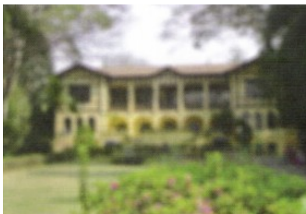
Figure 3. Cataract [8]