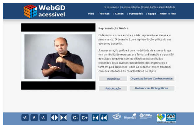
Figure 1. Screen shot of WebGD website