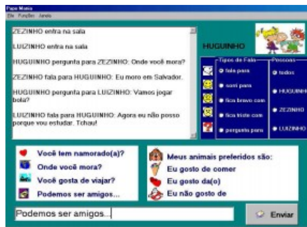
Figure 5. Papo-Mania software [8]

Reference [8] has tested nine color choices among users with low vision. The authors state that contrary to what many collaborators believed, the contrast of black background with yellow letters brought no apparent benefits to the reading and understanding the interface for most users. The dark blue background with white letters, bright yellow, light blue or light orange light was the contrast that allowed the best performance of navigation on the interface and proved to be the most efficient for reading as well. An example is shown in figure 6. The black background, with white, light blue, light yellow or