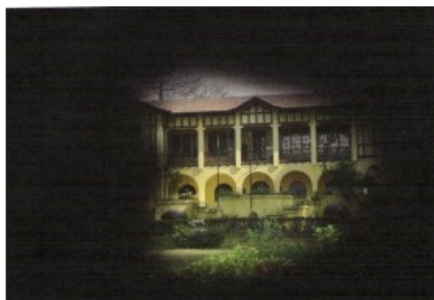
Figure 2. Glaucoma [8]

Some students have increasing visual difficulties, which often lead to sharpen senses like touch and hearing. In this scenario the authors [15] consider the use of the ICTs of fundamental importance for social and professional development of students.