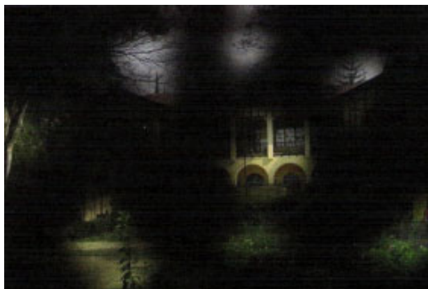
Figure 4. Diabetic Retinopathy [8]