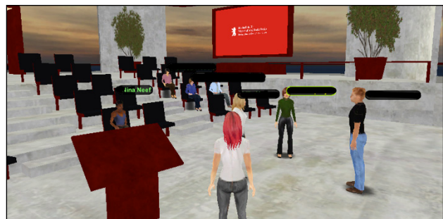
Figure 3. Role play situation, teacher coaches students business case

The experience in the 3D course has shown that through the immersion effect students showed "in their virtual identity" more openness in role-playing games in assertiveness training. The investigation in this paper is to find out, if improv theatre methods can intensify the interactivity and increase communication skills in student's role plays and presentations.