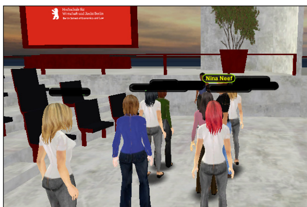
Figure 6. improvisation unit #3, "disaster, yes and - game", avatars walk in two lines

One example of an improvisational theatre game is shown in fig. 6. The students started via storytelling as a pair of 2 in rows, the first is telling a disaster, the second amplifies this by "yes and" - the first finds a solution for the disaster. Game ends, the next couple starts. The students practiced here active listening, fast communication, find quick solutions, teamwork.