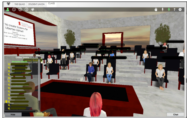
Figure 2. Start of a typical virtual session with avatars

So far, no improvisational theatre methods have been tested in the virtual BSEL. The interdisciplinary approach, to use theatre arts methods for team-building and team performance has already been successfully anchored in business. Scinto, a lecturer in Columbia University's strategic communications programs, summarizes why improv training improves communication: "They must be present in the moment, listening carefully, and contributing freely. These skills turn out to be particularly useful in workplaces that rely on adaptability" [12]. This, however, embedded in a virtual learning environment with limited emotional, physical expression possibilities of avatars is a new approach.