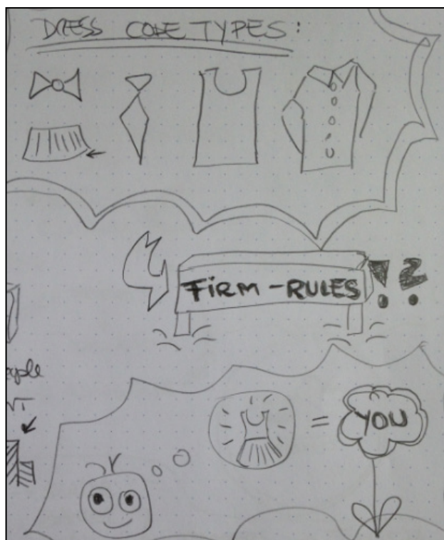
Figure 5. Graphic recording of the session #7 dress code by Nina Neef