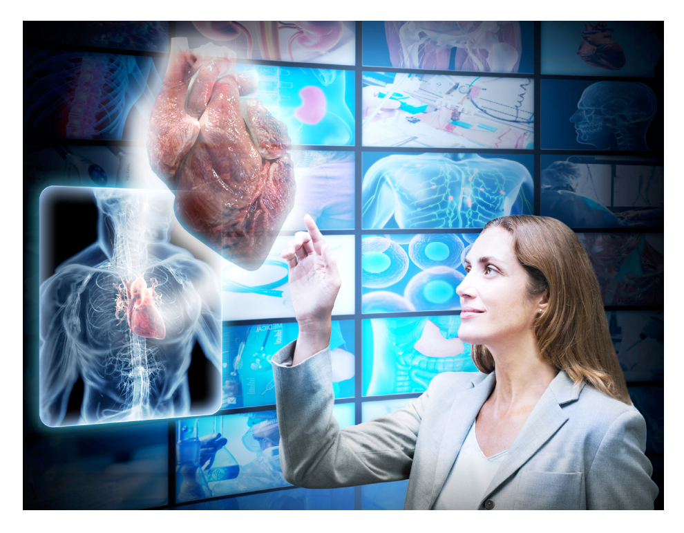
Fig. 4. e-REAL lab: interactive hologram

e-REAL integrates things, tools and objects from the real world within a multisensory scenario, based on short case-studies developed by visual storytelling techniques. Learners are completely immersed in a 3D or holographic scenario where they can interact with the contents by natural gestures--without the constraint of wearing glasses, gloves or headsets.