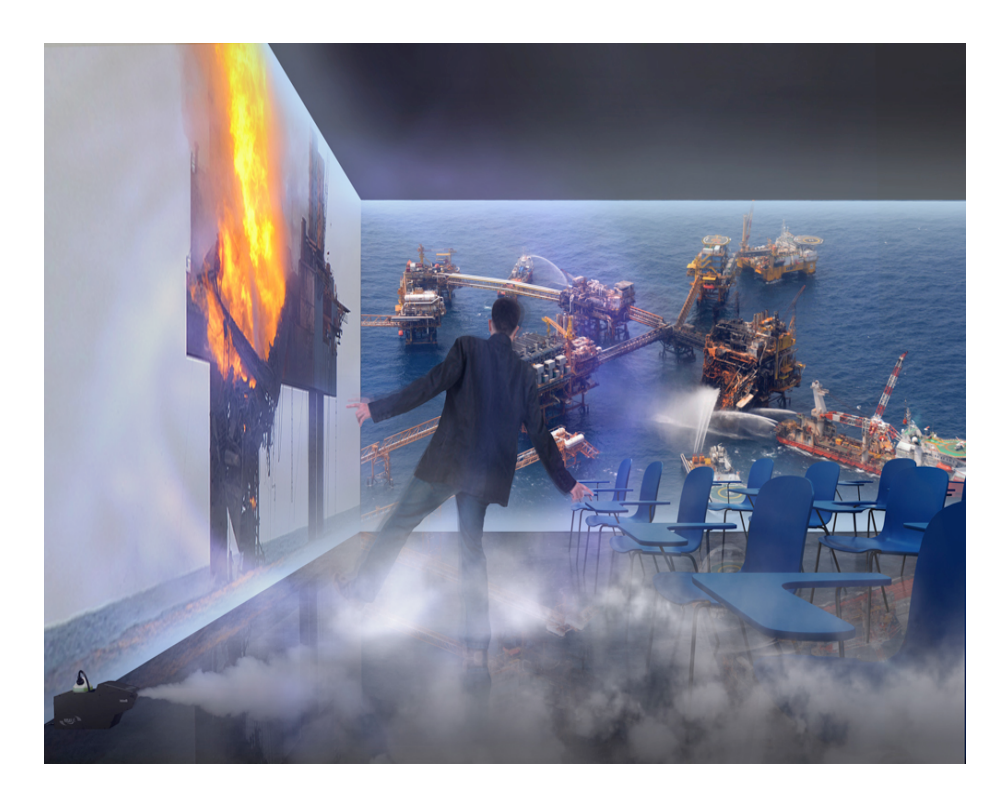
Fig. 5. e-REAL lab: real smoke in a virtual scenario

As an educational setting, e-REAL is a highly interactive and face-to-face lab that promotes proactive data and information research: everything is available, but learners have to actively look for it. It also allows online learning and knowledge sharing with remote teams, as well as interactive and cooperative e-learning.