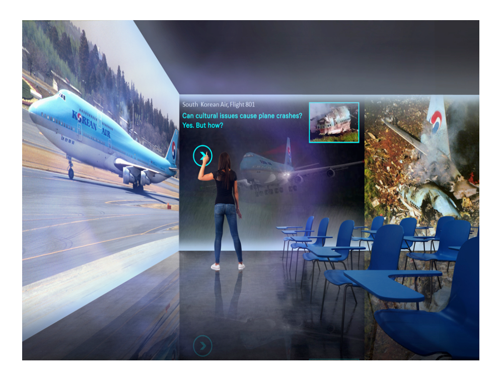
Fig. 7. e-REAL lab: Disaster Management