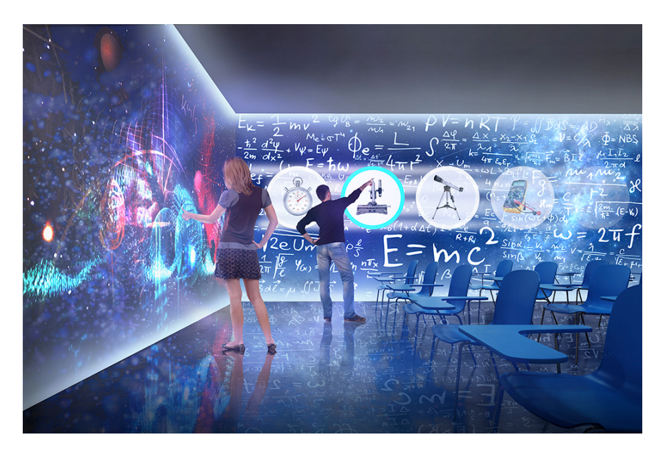
Fig. 6. e-REAL lab: Physics