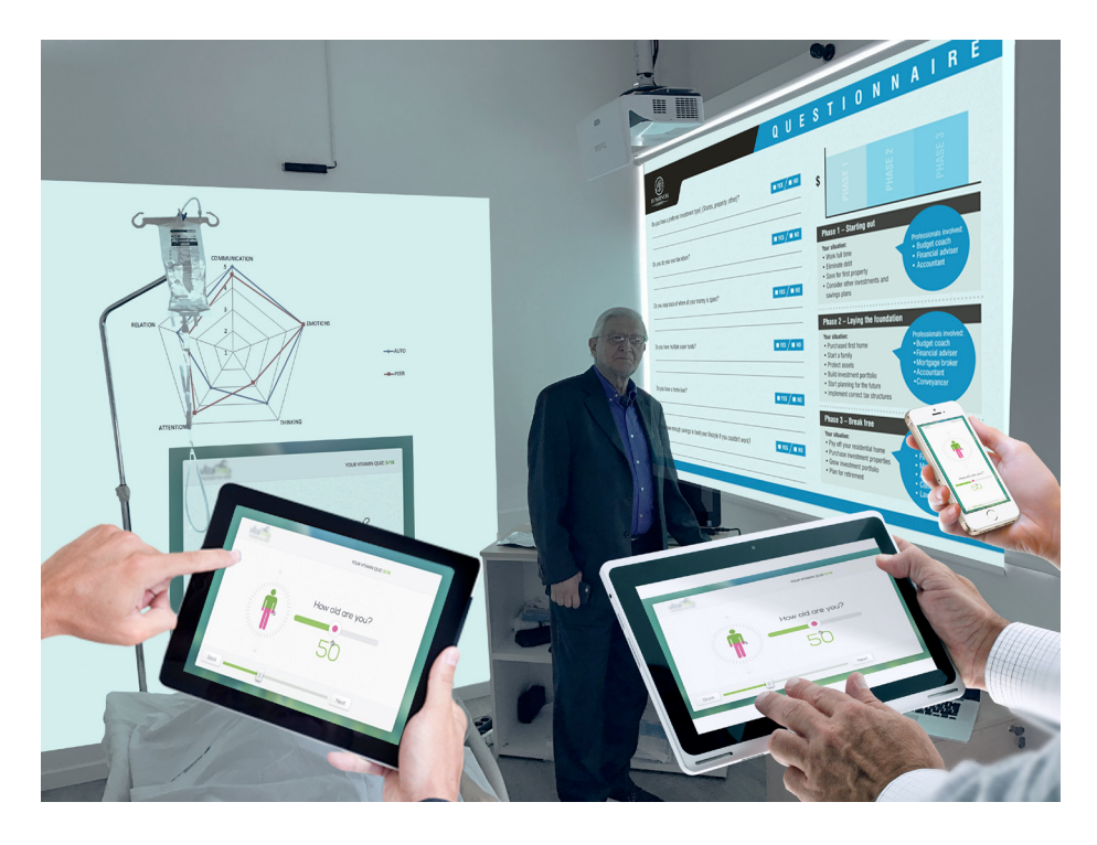
Fig. 3. e-REAL lab: feedback from fellow students and the instructor

Flip teaching is an interesting example: the students first study the topic by themselves, typically using video lessons prepared by the teacher or third parties. In class students apply the knowledge by solving problems and doing practical work. The teacher tutors the students when they become stuck, rather than imparting the initial lesson in person. Complementary techniques include differentiated instruction and project-based learning. Flipped classrooms free class time for hands-on work. Students learn by doing and asking questions. Students can also help each other, a process that benefits both the advanced and less advanced learners [7].