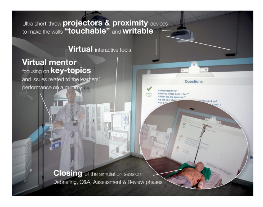
Fig. 1. e-REAL lab: Interaction with 2D and 3D images projected by very powerful ultra-short throw projectors--allowing flipped learning both face-to-face and online in a CAVE-like setting easier, more powerful and less expensive.