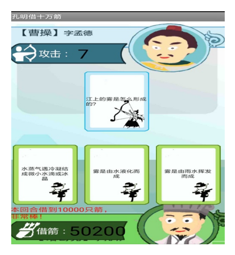
Figure 4. Screenshot of Athletics

The background of the Athletics was the story in Cartoon, and the players played games by role-playing for promoting the engagement. The goal of the game is to borrow 100,000 arrows from Cao Cao. Every time when the player is out of cards, the Athletics would display the number of arrows which the player had borrowed to make the player define the progress of the task (see Figure 4). When the player is at fault, the mobile phone vibrates to provide negative feedback and when the player wins the game, the mobile phone would sound a note of congratulation for the player, more specifically the sound of a firework display, to provide positive feedback.