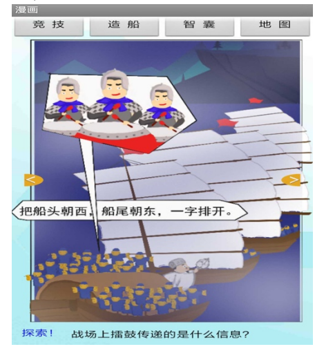
Figure 2. Screenshot of a Cartoon

Borrowing Your Enemy's Arrows used a central narrative to link every module together. The core narrative was a story of the Romance of the Three Kingdoms by Luo Guanzhong. This is an episode from the Three Kingdoms. Zhou Yu ordered Zhuge Liang to manufacture 100,000 arrows within ten days, a mission almost impossible, with the hidden purpose of punishing Zhuge Liang in case Zhuge Liang can not fulfill the task in time. Zhuge Liang rode a boat to the enemy's camp for making them believe surprise attack to shoot arrows. Zhuge Liang collected arrows by the scarecrows. The story is presented by comic so the students will be more interested and the relevant questions are set to promote students' thinking (see Figure 2).