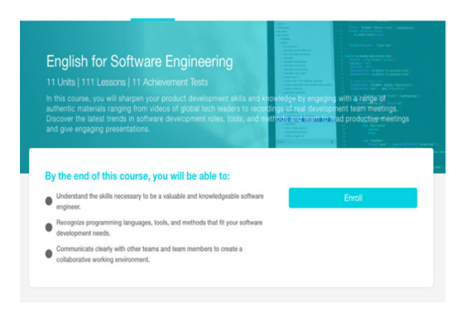
Figure 1. Voxy created its "English for Software Engineering" course in response to both learner feedback and the growing demand for software engineers worldwide

"English for Software Engineers" uses a web and mobile platform to provide highly contextualized English language instruction to current software engineers as well as engineers in training. Learners acquire the English they need to perform their job duties while simultaneously sharpening their product development skills and domain knowledge by engaging with a range of authentic materials, spanning from videos of global tech leaders like Apple, Google, and Microsoft, to recordings of real development team meetings to product documentation. They also discover the latest trends in software development roles, tools, and methods and learn to lead productive meetings and give engaging presentations.