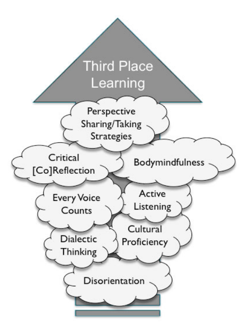
Figure 1. Third Place Learning: Conditions and processes