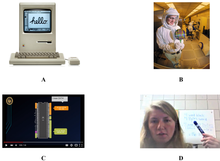
Fig. 1. Archetypes and Student Outcomes

Spectators voluntarily attended a vlog viewing event prior to an exam which was conducted during the last 20 minutes of the regular face-to-face class time on the last class day preceding the midterm exam. The students in attendance during these viewing sessions were encouraged to stay and watch the student-created videos as a review of course material that may be included in an upcoming exam. Even though the spectators had the option of leaving early from class, none of the students (spectators) who attended class the day before the exams, left the class. Instead they stayed and watched all the vlogs, even if they did not answer the content-related multiple-choice questions.