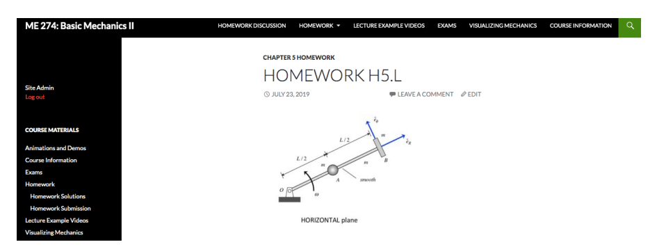
Fig. 2. A screenshot of the blended component of the Freeform learning environment. Each homework assignment contained its own comment thread within which students could discuss potential solutions to the problem. The blog was organized with convenient navigation features to enable quick access to course resources.

The course website also contained other blended resources such as multiple videos of solutions to the problems in the lecturebook, video solutions to homework problems, and "Visualizing Mechanics" videos that provide a visual live-action demonstration of Dynamics concepts.