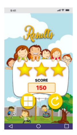
Fig. 11. Learning Outcomes page

Fig.11 is the result of playing the game selected. The result is a value that is answered correctly by the user and is given with an illustration of how many dimensions can be obtained. Each question answered correctly is worth 10.