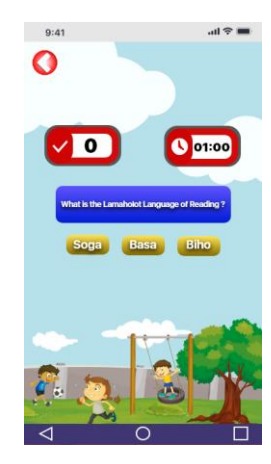
Fig. 10. Guess the Language Lamaholot Page

Fig.11 is the result of playing the game selected. The result is a value that is answered correctly by the user and is given with an illustration of how many dimensions can be obtained. Each question answered correctly is worth 10.