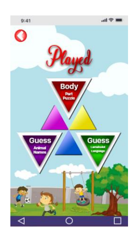
Fig. 2. Homepage