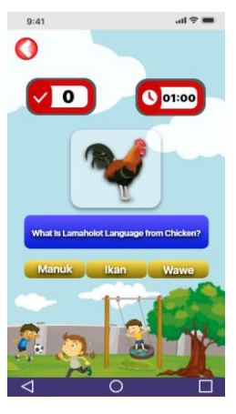
Fig. 9. Guess the Animal Names page