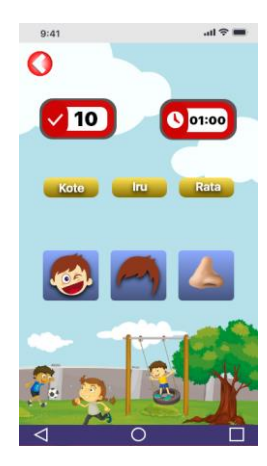
Fig. 8. Body Parts Puzzle Page