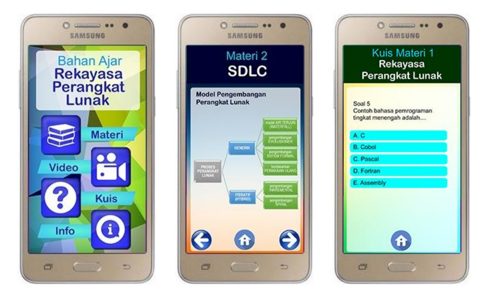
Fig. 3. Screenshot of Android-Based Teaching Material, from left to right: home menu, material display, and menu quiz display