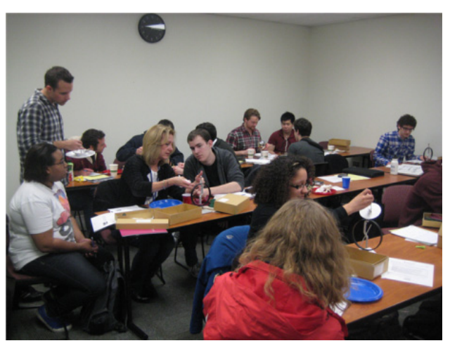
Figure 3. Teams of students performing electrostatics activities.

are working independently to build their motors. At the end of the activity the students are allowed to keep the motors they have constructed. The first person to get their motor to function properly often "wins" a small physics prize. While this activity is done individually, there is typically a significant amount of group interaction as students have learned the importance of teamwork by this point in the semester!