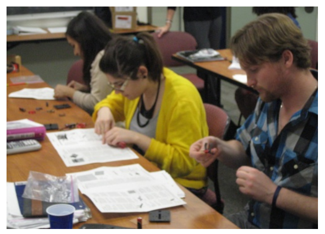
Figure 4. The motor-building activity.

In recent years, a number of writing techniques have evolved that make use of various writing-to-learn strate-