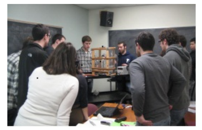
Figure 2. Students investigate the properties of sound.