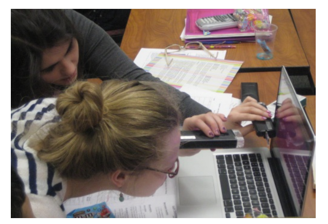
Figure 5. Students investigate color using a computer monitor.