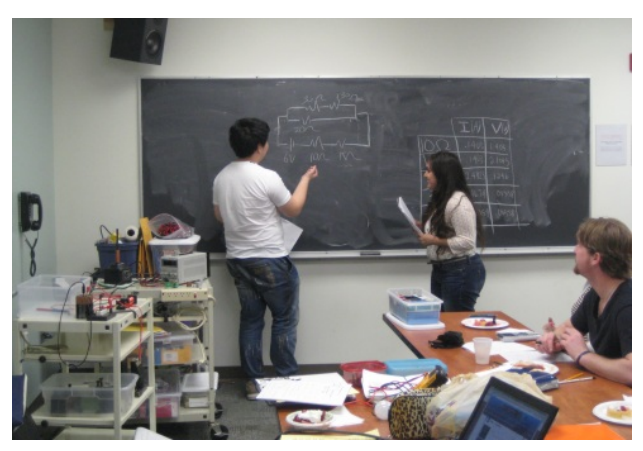
Figure 6. Team members work as TAs to assist other class members.

gies within the domains of STEM education [38 - 50]. The use of writing in introductory classes for non-majors (andmajors) may be an effective vehicle for allowing students to enhance their critical thinking and problemsolving skills. Writing can also assist students with the identification and confrontation of personal misconceptions [51]. For the instructor, errors made within these writing activities can be more revealing in terms of what students are really thinking, and provide additional information on their conceptual model-building more so than can errors made on typical multiple choice or other tests.