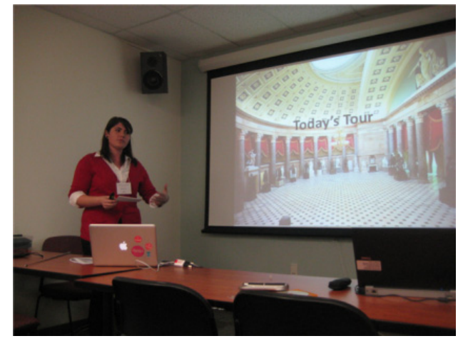
Figure 9. A student presentation at the 12<sup>th</sup> Annual New Millennium Conference.

At the beginning of the term, students are informed that throughout each phase of the project they will be "banking" points towards their overall conference paper grade. Armed with this information, students are empowered as they complete each phase of the activity. Each phase of the activity also provides the instructor with a way to more clearly chart each student's overall learning in a deeper and more robust way. For example, during the peer review process, the instructor gains valuable information about student understanding based on the nature of the com-