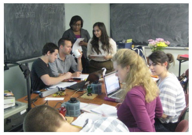
Figure 1. Students use the team approach to tackle new concepts and work through projects and activities.

The motor-building activity is done individually. Each student is given a motor kit and works individually to build a working motor. In Figure 4 (next page), students