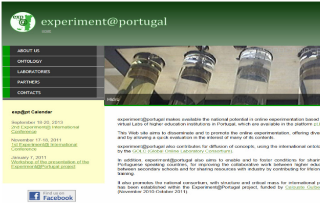
Figure 1. experiment@portugal Web page.

The Portuguese version is an image of the original platform, preserving all the original characteristics and properties, and is also supported by a search engine of the information associated to each RVL resource. Fig. 2