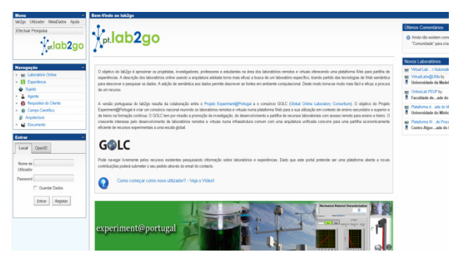
Figure 2. Home page of the pt.lab2go platform.

The user interface (Fig. 3) is developed in LabVIEW 7.1 and can be remotely actuated. But, several parameters should be established and introduced by the user as, for example, the desired calibration range. The lower limit of the range is naturally imposed by the bath equilibrium at room temperature (visible in the digital display). The upper limit is set by the user and should not exceed a