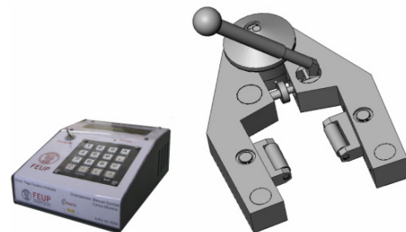
Figure 4. Digital under-bed scale system