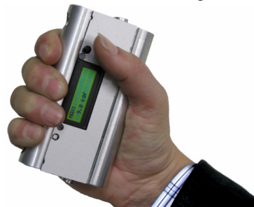
Figure 3. Small, accurate, digital, auto-ranging and light Handgrip

By then he engaged the ongoing work of a new project in the same line, but now for evaluating % of body fat (%BF). The objective was to develop a system for evaluating the %BF based in the design of a novel mechanical structure and of a dedicated virtual instrument. Finally, a wireless communication system between them was also designed and developed. In July 2010, the author became a member of the Associate Laboratory LAETA, where the research Unit UISPA is integrated.