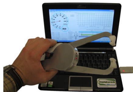
Figure 5. LipoTool – the integrated system