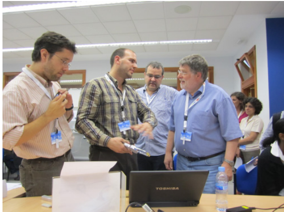
Figure 6. LipoTool – REV2012 Exhibition Session

Since then the author has been working in the development of the LipoTool system, Fig. 5, collaborating in two already submitted patents now pending (one national and another international, [4-5]), participating actively in the market evaluation, collaborating in the submissions of LipoTool to two awards recently achieved, also co-authoring several communications in conferences [10-20], where he has represented the team. Six LipoTool systems have been sold and are now working in research centers/units/institutions. Here, he has been acting as one of the bridge elements between the new system users.