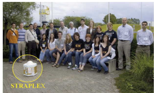
Figure 2. STRAPLEX workshop participants, Noordwijk, Netherlands