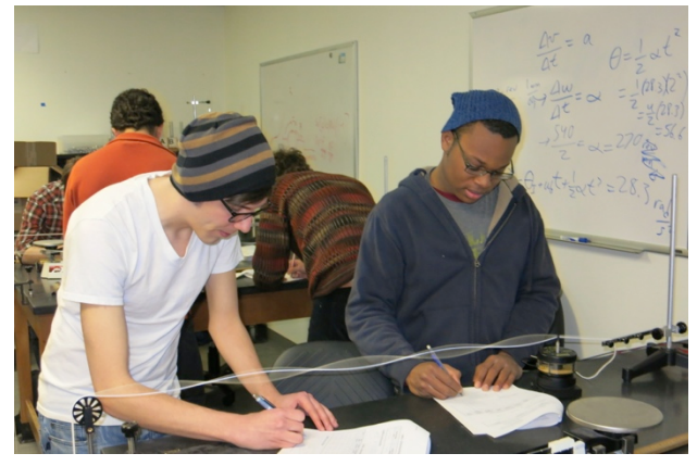
Figure 2. Student teams investigating standing waves on a string.

such away so as to provide students with an opportunity to pursue inquiry and investigation using a variety of techniques. Whether students are investigating sound waves in air, building a motor, or learning about light and color, a team approach takes center stage. Fig. 1 and 2 provide an illustration of how the classroom is structured based on a team environment.