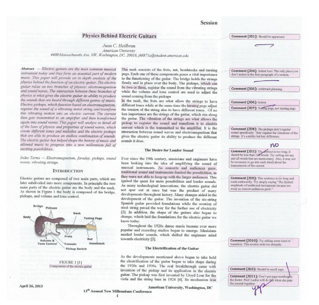
Figure 8. Sample student peer review.

Near the beginning of the paper writing process, students were shown the conference paper assessment rubric (Fig. 3). Hence, they were advised in advance as to how their work would be assessed. The students knew understood that they were "banking" points towards their overall paper grade through each part of the process. Students earned points towards their overall paper grade as they completed each required part of the paper. The final copy of their papers were worth a substantive amount of points as it is here that they are demonstrating that they've utilized the feedback they'd been given. In addition, each phase of the process was designed to empower students to make their final papers the best that they could be.