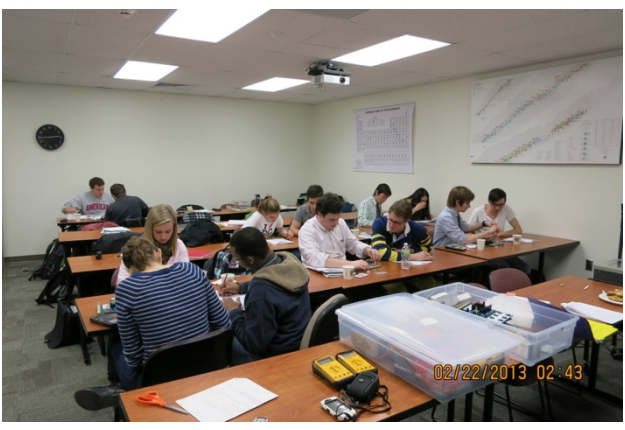
Figure 1. Teams of students working with electric circuits.