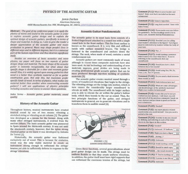
Figure 6. First draft submission and instructor's feedback.

Upon receipt of the instructor's feedback on their first drafts, students have approximately 3 weeks to complete a second draft of their paper. Students are then assigned