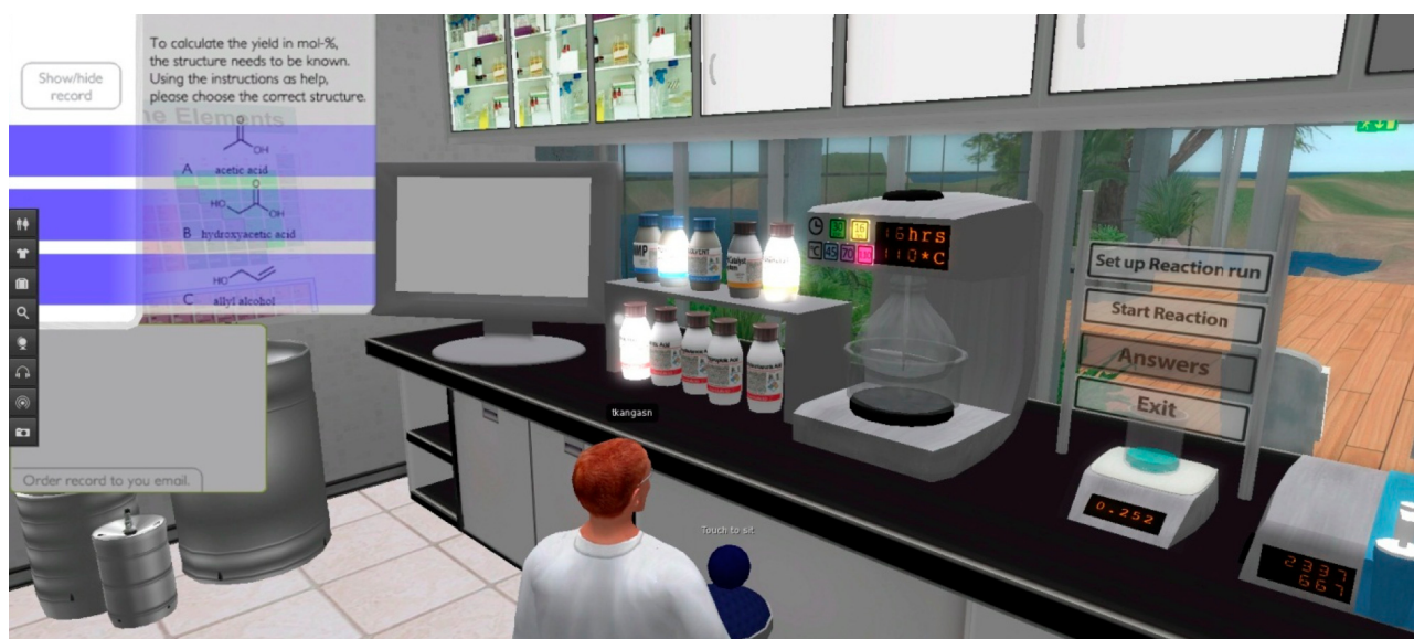
Figure 1. Screenshot: The organic chemistry simulation on decarboxylation reactions. HUD window on the left

Upon entering the laboratory an introduction and short instructions are given for performing the task. Avatars will wear appropriate clothing: lab coat and gloves. The objects mentioned below work by clicking on them. The task begins with extracting RNA from a sample of virus in host cell matrix (Figure 2). Buffer is added, incubation and centrifugation are performed, and a DNA-decomposing enzyme, DNase, is added to recover pure viral RNA after a series of extractions and centrifugations. The polymerase chain reaction (PCR) is then performed, followed by electrophoresis to visualize the sample and to verify that the experiment is proceeding as planned. In each of the