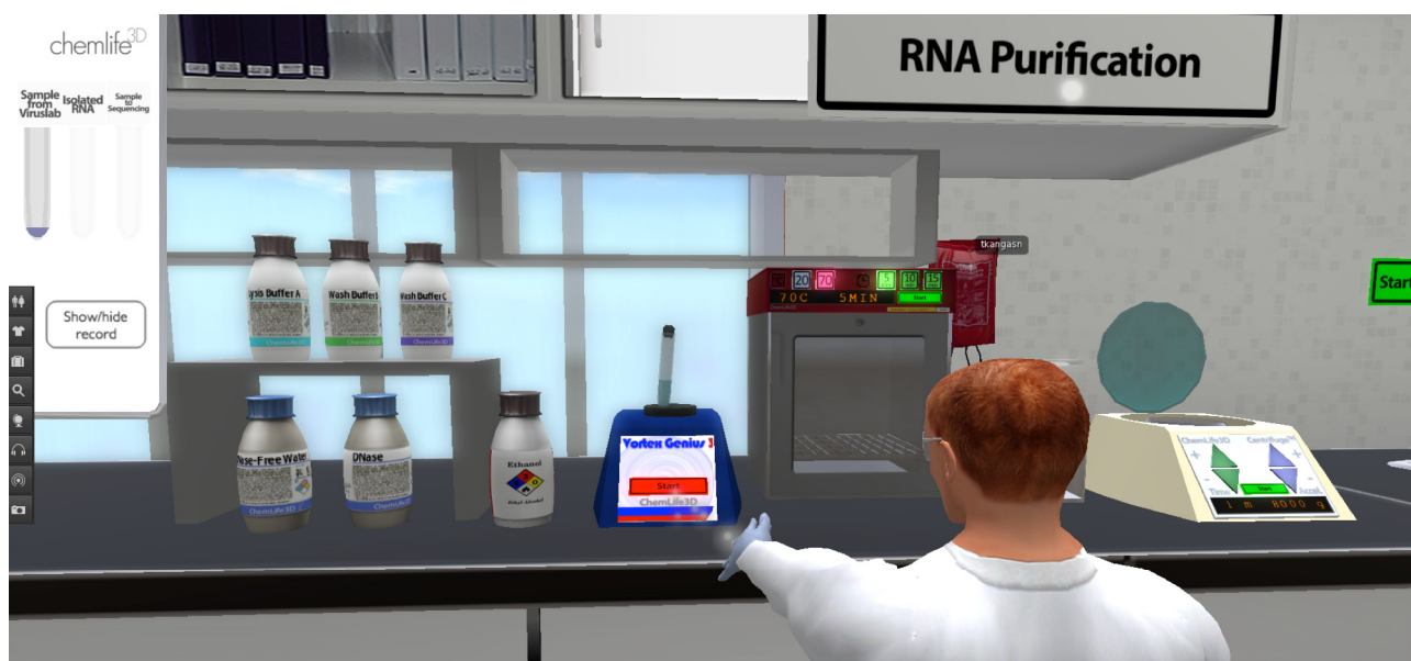
Figure 2. Screenshot: The molecular biology experiment. HUD window on the upper left