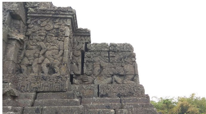
Fig. 9. A relief of Kresnayana