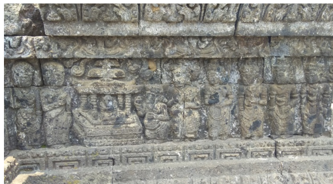
Fig. 8. A relief of Arjunawiwaha