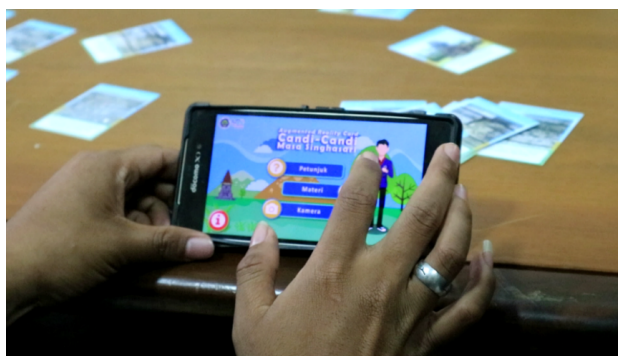
Fig. 11. The interface of Arc

In addition to the main components mentioned above, there are also supporting components to develop AR on an Android smartphone. The supporting components are Vuforia qualcomm or Vuforia SDK. Vuforia Qualcomm is an Augmented Reality Software Development Kit (SDK) that enables the creation and development of AR applications on smartphones. Vuforia detects images using marker detectors and