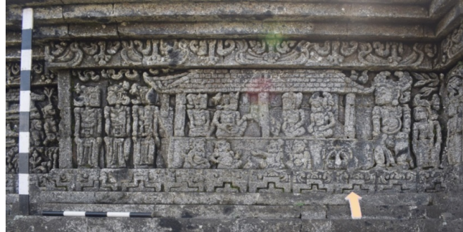
Fig. 7. A relief of Kunjarakarna