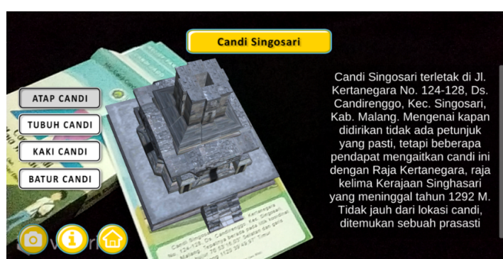
Fig. 12. An Example of 3D model shows in Arc

AR technology can be used as media for historical learning to assist teachers in depicting 3D model of reliefs, Candi Kidal, Jago and Singosari objects. We developed AR for Hindu's heritage in the Singhasari titled Arc as media in learning history of Singhasari and its heritage [16]. In this research, we are focussing on the effectivity of Arc as history learning media to increase students' score.