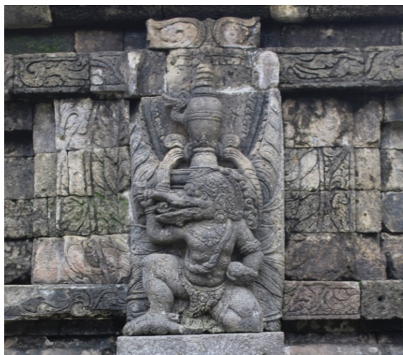
Fig. 2. A panel of Garudeya relief depicting Garuda carrying exilir of life