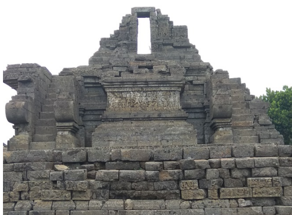
Fig. 3. Candi Jago