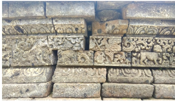
Fig. 4. A relief of Tantri Kamandaka about goose and turtles

na) to Mount Indrakila to get a weapon for defeating Kurawa. The last relief is Kresnayana telling the story of the wedding of Kresna (a figure on the Mahabharata story) with Rukmini.