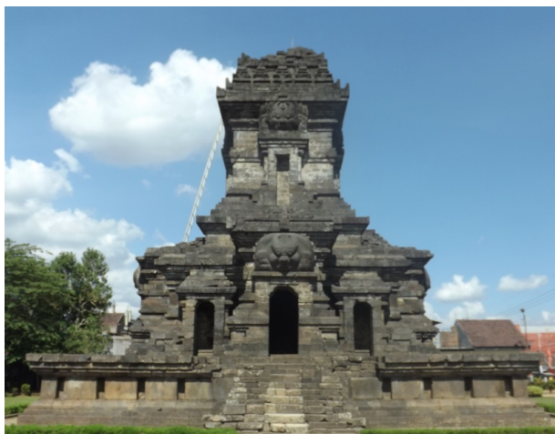
Fig. 10. Candi Singosari

Unlike two other temples mentioned before, Candi Singosari has no story relief. This temple lies on the northern side of Malang and built as deification site for Kertanegara, the last king of Singhasari. It is estimated that this temple is not yet completed and left because the kingdom was attacked by Jayakatwang. However, among the Singhasari heritage in Malang, this temple is relatively intact.