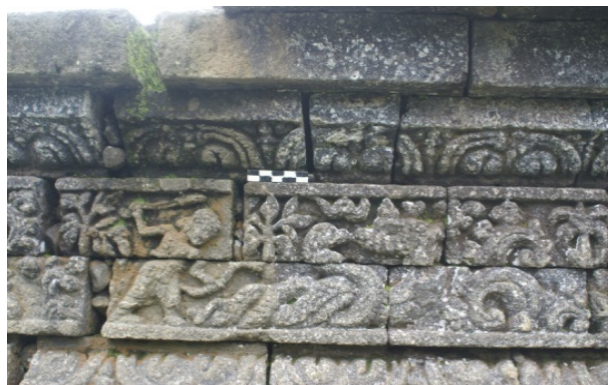
Fig. 5. Relief of Ari Darma