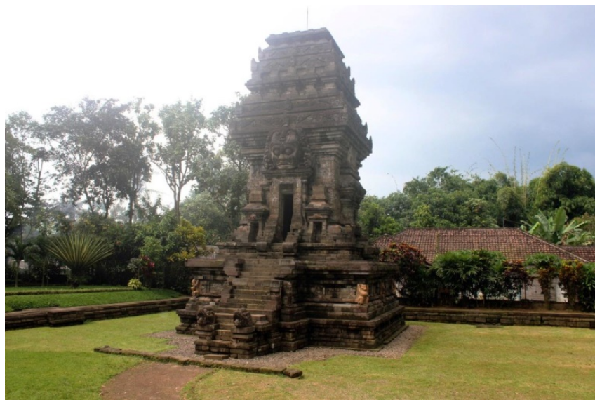
Fig. 1. Candi Kidal

Candi Kidal and Candi Jago are decorated with reliefs. There are two types of reliefs in those temples, decorative reliefs and story reliefs. While decorative reliefs only have decorative function to make the temples beautiful, the story reliefs have certain stories. Those stories usually inspired by Hindu's myth i.e. Mahabharata and Ramayana.