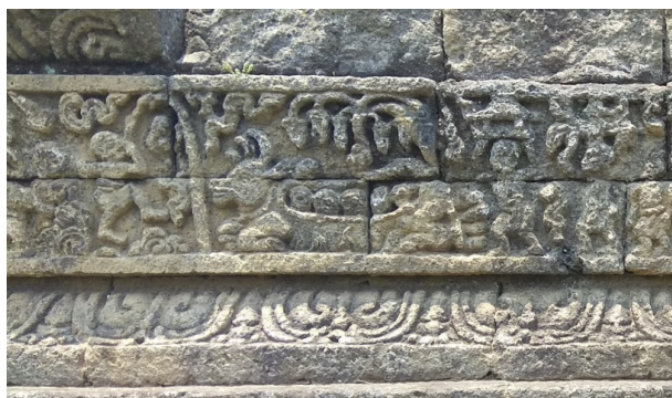
Fig. 6. A relief of Parthayajna