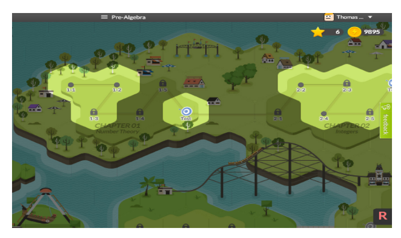
Fig. 2. Map of student activities

The responses that students enter in WMT fulfill three main functions. First, they allow programs to examine understanding and determine what skills or topics are causing problems as a teacher would. Data obtained in the examination is transferred to the teacher in real-time. Second, they provide opportunities for students to overcome previous knowledge gaps by practicing the skills needed. Finally, the active involvement of students in WMT makes them involved in the learning process.