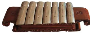
Fig. 3. Illustration demung instrument in pelog musical scale

where some instruments have seven buttons for note 1, 2, 3, 4, 5, 6, 7, and some have eight buttons with one button is for higher note 1. The following Figure 3 shows demung instrument in pelog musical scale.