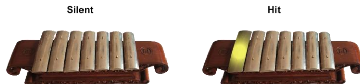
Fig. 4. Instrument animation for a user interaction visualization

Audio and visual data were collected from gamelan instruments set owned by Universitas Dian Nuswantoro, Indonesia. Each button of gamelan instruments was separately recorded, and then the data were embedded into the application. The audio data sounded according to the button hit by the user. For the visualization, all instruments were photographed, and then the pictures were manipulated using image editor, including animation of user interaction. Each key was manipulated for silent and hit moment. Figure 4 shows the illustration of an instrument animation for a user interaction visualization.