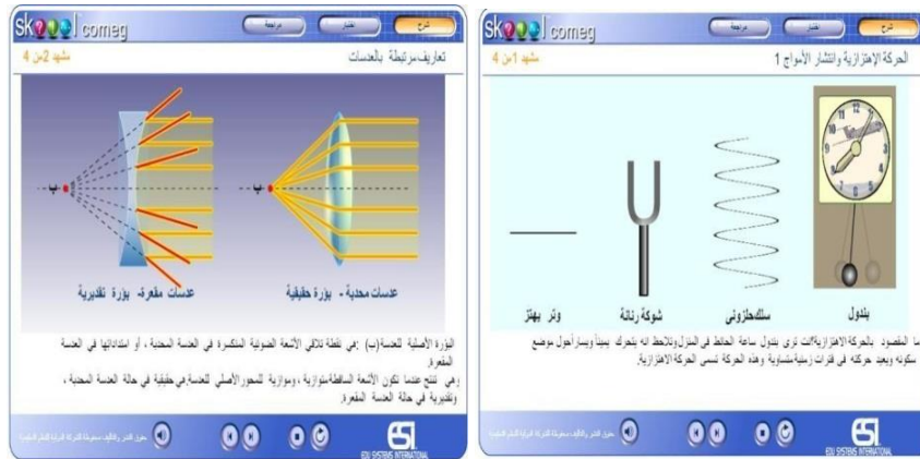
Fig. 4. 3D Interactive Lessons in Skoool Website by Skoool http://www.skoool.com.eg/Default.aspx?tabid=87

All these resources were used as scaffolds for the student learning process to encourage them to engage with knowledge in active and dynamic ways. The use of multimedia and the flexibility in using the teaching resources enabled the teacher to meet the learning styles of all students.