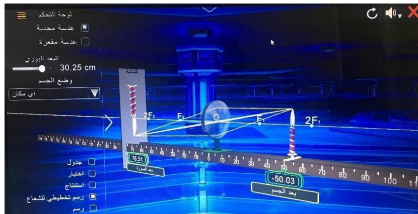
Fig. 2. 3D- Simulation in the Light Topic by Eureka ( https://www.designmate.com/ )

Additionally, the lab has simulations feature that allows students to manipulate different variables, predict, and visualize the results (Figure 2). These simulations were available for some of the digital lessons. They served as a mini virtual laboratory when students manipulated the variables in the given reactions and predicted the results.