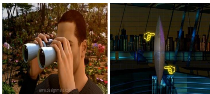
Fig. 1. 3D- Video Explains the Convex Lenses Topic by Eureka ( https://www.designmate.com/ )

The 3D-Virtual Environment: Eureka® product as a 3D-VRLE along with the other teaching materials to conduct the experiment. The environment is a digital instructional package, called “Eureka.in Top-Bottom 3D Content”, which has a large collection of digital units, animated movies, and simulations, in different physics subject (Figure 1). The product was developed by Designmate Company. It was selected because of its suitability to explain and demonstrate the physics topics and concepts in an interactive way. It was used in teaching the (Unit 4: Waves and its Applications) in grade 8th science curriculum and used for 8 weeks comprising 16 lessons with 2 classes per a week.