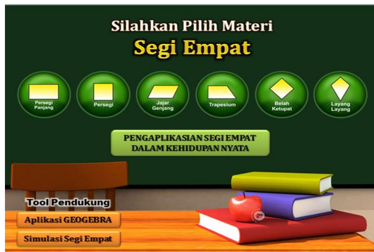
Fig. 1. Display E-learning Media

The e-learning media used in this research is an application designed specifically for rectangles, GeoGebra applications, and Powerpoint presentations with animation, as shown in Figure 1.