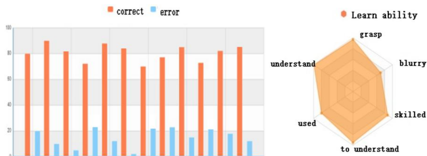
Fig. 3. The evaluation examples