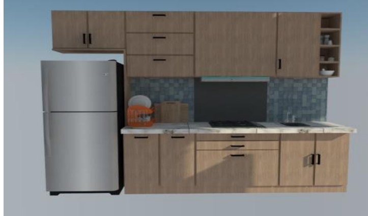
Fig. 1. Interior preview through PowerPoint slide