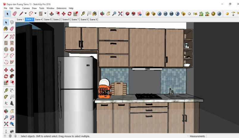
Fig. 2. Interior preview through Google SketchUp Application

Moreover, Learning can be defined as behavior changes that can produce an ability from the learning experience and interaction of students with their environment [15]. According to the statement, the students' ability of building interior design are: (1) able to present the basic principles of 3D images, (2) able to operate 3D drawing orders, (3) able to make 3D images using the material editor function, and (4) able to examine the results of 3D drawing rendering.