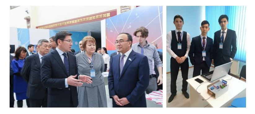
Fig. 4. Minister of Digital Development, Defense and Aerospace Industry of the Republic of Kazakhstan A.K. Zhumagaliev at the exhibition Digital ENU

After conducting project training in programming microcontrollers, participants formed a holistic view of the project, and awareness of the completeness and significance of their activities increased the students' self-esteem. Also, the participants learnt to apply theoretical knowledge to solve real world problems in practice and received an unforgettable experience working in team.