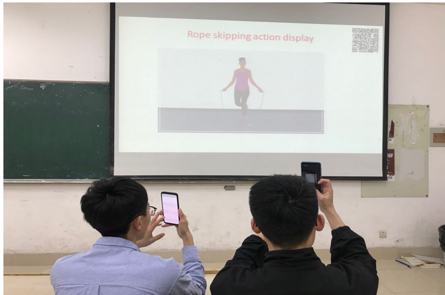
Fig. 4. Practical link 1 of microcourse teaching of sports training integrated with the five-star teaching method