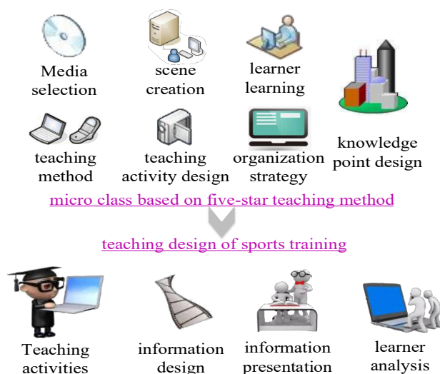
Fig. 2. Selection diagram of microcourse analysis

It can be seen from the flow chart of microcourse design that it needs to go through five main processes, including preliminary analysis, scheme design, material preparation, development and production, and test and evaluation. In the process of scheme, teaching content, interface and interaction design need to be carried out to form the script of the overall micro-course. It is necessary to use necessary design tools and software in the process of microcourse design. Mastering the use methods of these software tools becomes a necessary skill for teachers in the process of microcourse design. After the completion of microcourse design is not static, according to the teaching effect and evaluation, reflection and improvement of microcourse is also essential. Fig. 4 and 5 show the practice of microcourse of sports training integrated with the five-star teaching method.