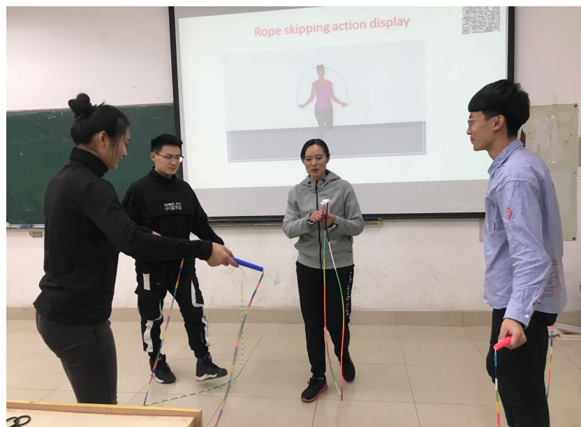
Fig. 5. Practical link 2 of microcourse teaching of sports training integrated with the five-star teaching method