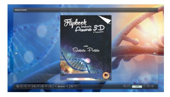
Fig. 1. Flipbook Cover

Fig 2 shows a cover page that appears automatically when a Flipbook is open. On this page, there were two layers; the first layer was the Flipbook cover layer, while the second layer contains the Flipbook background in the form of a DNA image. At the bottom of each page, there were Flipbook control and navigation buttons for easy use.