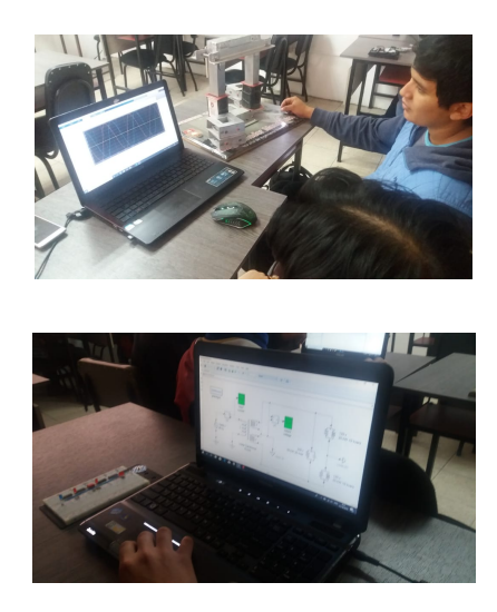
Fig. 3. Students simulating using MATLAB.

However, the course requirement is that students develop their own personal simulation models for each problem, which means that they must develop the proposed simulation using the reluctance with hysteresis block in a magnetic circuit. Students will learn the difference between a real and an ideal transformer. It is important to note that for each group, the problems were modified slightly to avoid the possibility of plagiarism.