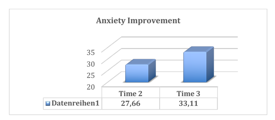
Fig. 1. Percentage of improvement for the anxiety compared with the Time 1

The inferential statistics were used to determine whether these recorded improvements were significant or not. The results of one-way ANOVA for the factor of anxiety over time revealed that differences among the anxiety tests were statistically significant F ( _2 , _{52} ) = 111.492, P<0.001, \eta 2= 0.811). Furthermore, the Bonferroni post hoc test was performed to compare the mean scores and to evaluate the changes for mean differences of anxiety across the time. The results of the Bonferroni test, as shown in Table 3, illustrated the differences among all tests which were statistically significant (p<0.001).