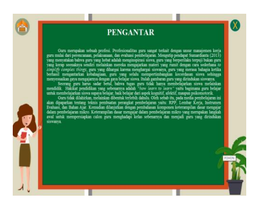
Fig. 2. Introduction Interface

There is also lesson aims option to access easily purposes and content of presented material. Learning with this media aims two things, that is to understand mechanism of making learning media and to understand components of basic skill of teaching. In this option, it has navigation buttons to exit from the media or go back to home menu page, as well as background music button (see Figure 3). Lesson material menu has two options (see Figure 4), which are mechanism of making learning media and components of basic skill of teaching. Mechanism of making learning media material discusses learning devices with examples as well, such as RPP (lesson plan), LKPD , teaching material, and evaluation instrument (see Figure 5). Components of basic skill of teaching material discusses seven skills in teaching (see Figure 6). Each component is provided with relevan practical videos (see Figure 7). In this menu, navigation buttons to exit from the media or go back to home menu page, as well as background music button are provided. Next menu is references and developer profile.