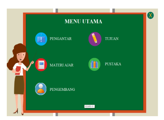
Fig. 1. Home Menu Interface

At this stage, the researcher designed the concept of learning media products based on multimedia lectora on the basic skills of teaching. Researchers design each component in this product in details. The components are cover page with various color and font, home menu consisting of introduction, aims, learning material, references, and developer. Each home menu has materials in sync with the title. Exit navigation button is also pasted there, as well as background music (see figure 1). Introduction page (see Figure 2), has navigation buttons to exit from the media or go back to home menu page, as well as background music button.