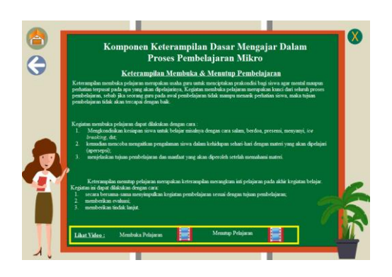
Fig. 7. Relevant video menu for a component in Seven Skills in Teaching Material