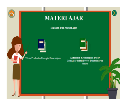
Fig. 4. Lesson Material Menu