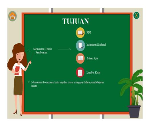
Fig. 3. Lesson Aim Menu

There is also lesson aims option to access easily purposes and content of presented material. Learning with this media aims two things, that is to understand mechanism of making learning media and to understand components of basic skill of teaching. In this option, it has navigation buttons to exit from the media or go back to home menu page, as well as background music button (see Figure 3). Lesson material menu has two options (see Figure 4), which are mechanism of making learning media and components of basic skill of teaching. Mechanism of making learning media material discusses learning devices with examples as well, such as RPP (lesson plan), LKPD , teaching material, and evaluation instrument (see Figure 5). Components of basic skill of teaching material discusses seven skills in teaching (see Figure 6). Each component is provided with relevan practical videos (see Figure 7). In this menu, navigation buttons to exit from the media or go back to home menu page, as well as background music button are provided. Next menu is references and developer profile.