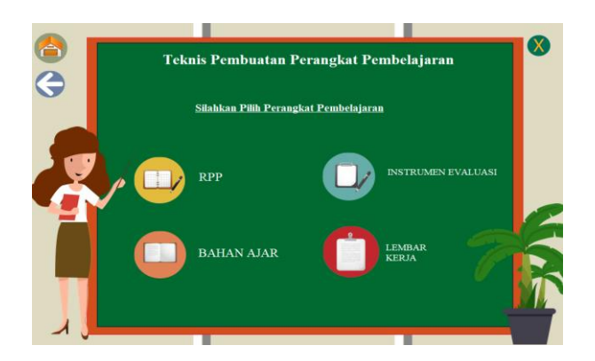
Fig. 5. Mechanism of Making Learning Media Material Menu