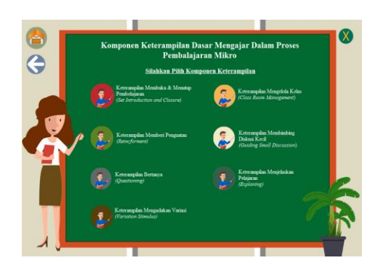
Fig. 6. Seven Skills in Teaching Material Menu