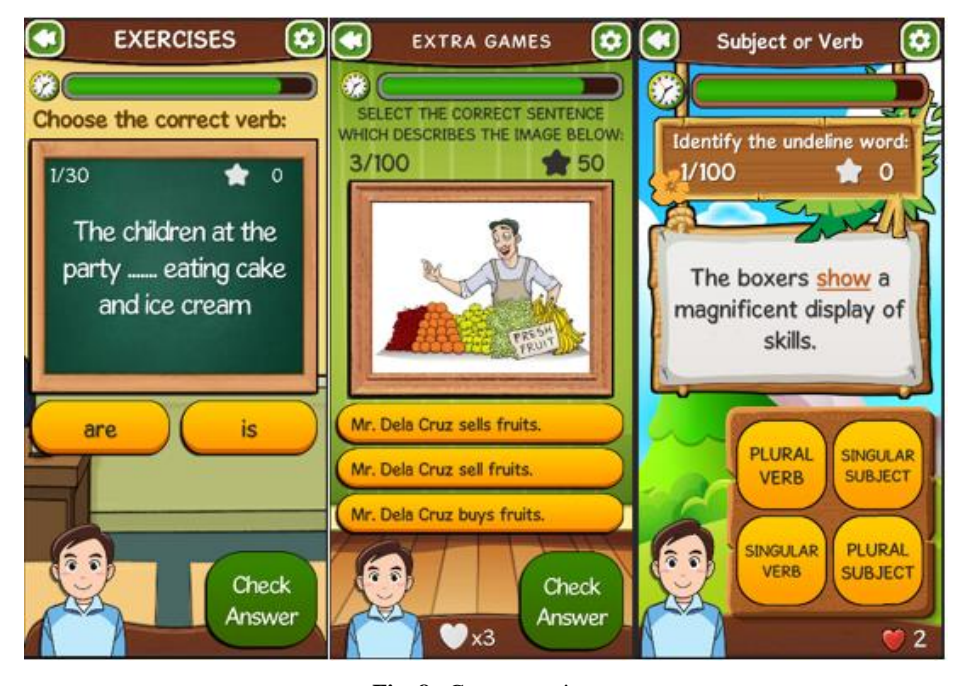
Fig. 8. Game exercises