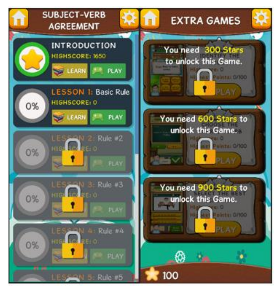
Fig. 4. List of available lessons and games for each SVA concepts

The application comprises two (2) main parts, the Learn and Play mode. In the Learn mode, the students are presented with 10 lessons (Figure 4) about subject-verb agreement (Table 2). Based on the themes from the interviews with the teachers, a locked function was added to ensure that students must first learn the lesson in Learn mode and answer at least 50% of activities in the Play mode correctly before proceeding to the next lesson. Star points are given when a lesson is finished (Figure 3). Extra games in the form of activities can be unlocked once the user accumulated the required star points (Figure 4).