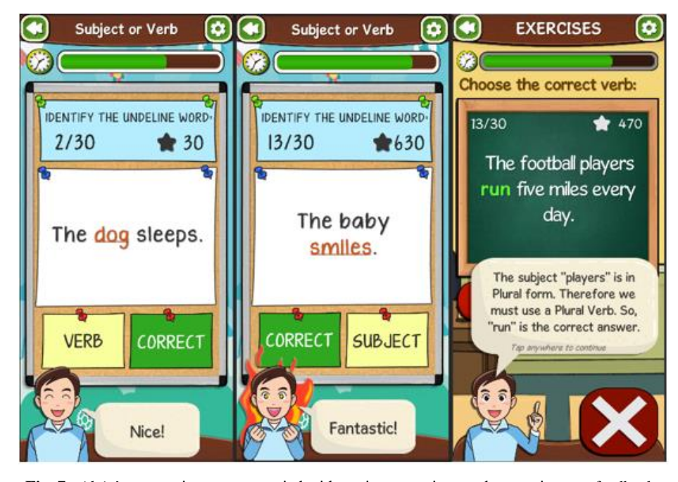
Fig. 7. Alvin's expressions accompanied with static expressions and corrective text feedbacks

Figure 8 shows how exercises in the Play mode are provided by the developed mobile learning application. The number of total exercises in each lesson are also shown in Figure 8 (e.g., 1/30, 3/100, 1/00). The exercises are provided in a randomized manner every time the user opens the Play mode. For the extra games, the user is provided with three heart points as seen in Figure 8. Each heart point is deducted when the user provided the wrong answer until it reaches zero to which the extra exercises will end.