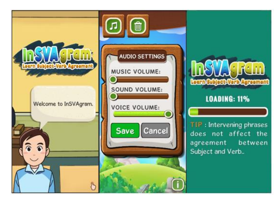
Fig. 3. Welcome screen, application settings, and loading tips

In the developed mobile learning application, on startup, the user is greeted with a welcome screen (Figure 3) that requires the user to provide a username so the animated character named Alvin can address the user properly. Initial features of the application include the ability to modify its audio settings (i.e., adjusting music, sound, and voice volume) (Figure 3). The music and sound volume are intended for the background music, application's response from clicks, and completion indicators (Figure 5) that are all integrated throughout the application. On the other hand, the voice volume is intended for Alvin as he guides the user throughout the interaction in the application. Additionally, the application also provides tips each time the application loads or transitions to another section (Figure 3).