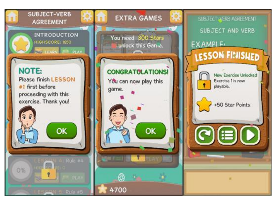
Fig. 5. Unlocking, notification, and congratulatory remarks by Alvin