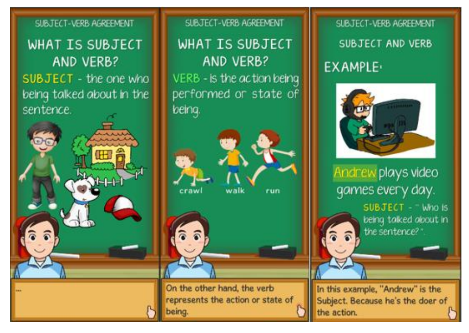
Fig. 6. Game lessons as narrated by Alvin

Figure 6 shows Alvin narrates the lessons (Figure 6), provides basic corrective feedback in forms of text (Figure 7) and a variety of static expressions (e.g., Figure 7). The actual lessons narrated by Alvin are provided with visual cues to help the user understand the topic at hand. For the expressions, an example of these is a very fiery enthusiastic expression accompanied with a text "Fantastic" is shown by Alvin when the user answered seven exercises in succession (Figure 7). These features were added to engage the user when using the application. Such a feature is found to be helpful as a pedagogical feature of an application particularly in language learning [27], [28], [30]. Additionally, a skip and forward feature (i.e., buttons) is added only when the user finishes the lesson once. This allows the user to skip or forward the lesson easier if wanted to revisit the lesson.