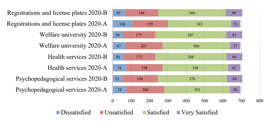
Fig. 2. Student satisfaction with pedagogical supports

Figure 2 shows the results obtained in relation to the evolution of student satisfaction once the online pedagogical support services were implemented, which were adapted from the 2020-A academic semester.