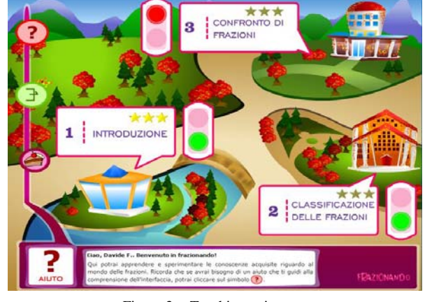
Figure 3. Teaching unit menu

In the teaching unit map, the traffic lights indicate whether the units are accessible or not to the student. The stars in the balloon indicate the student's ability to solve exercises in the units. They are lit up according to the mean student's ability to solve the exercises presented in the related subunits.