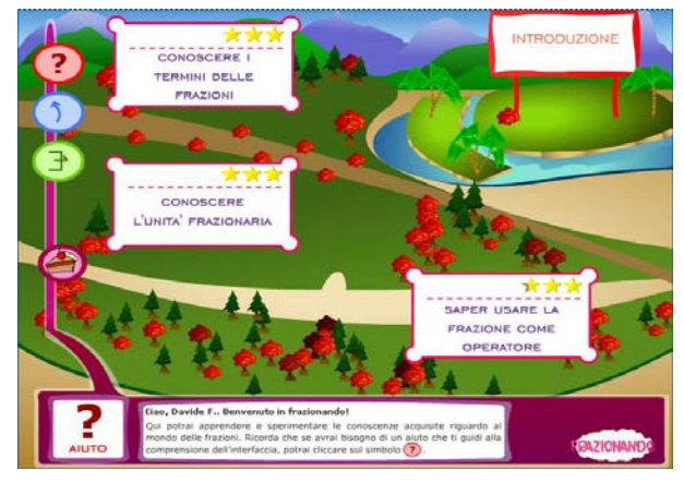
Figure 4. Teaching sub-unit menu

In the teaching subunit map, the stars in the road signs indicate the student's ability to solve the exercises in the subunit. They are lit up according to the student's ability to solve the exercises presented in the subunit.