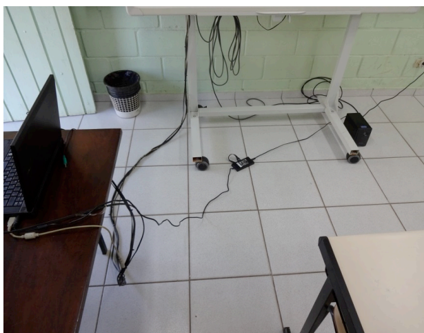
Figure 1. Set disposition.

educational games found in the course book and or/ materials prepared by third parties.