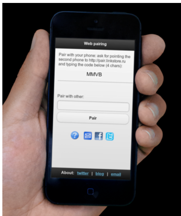
Figure 1. An initial screen for WebPair application.

Of course, this URL could be different for the service on another domain. The opened mobile web page contains some unique 4-digits code. The picture will be the same in the second (third, etc.) browser. Of course, each party will see an own code. This random code will be used for pairing two devices. The schema for pairing is similar to Bluetooth pairing. There are two parties: master and slave. A master browser transfers the data, a slave browser accepts data.