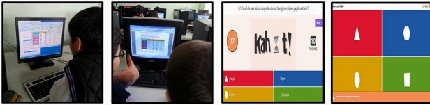
Figure 3. Example images from the implementation of Kahoot

The students in the control group completed the same activities using traditional methods. The teacher taught the topic, and the students did the given activities. Kahoot and ClassDojo were used in every lesson for the experimental group. As seen in Table 1, every week had a different gamification activity.