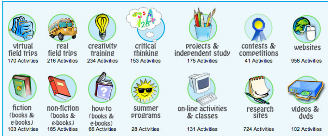
Figure 3. Enrichment Activities

Check this box to view your favorites and your teacher favorites only!