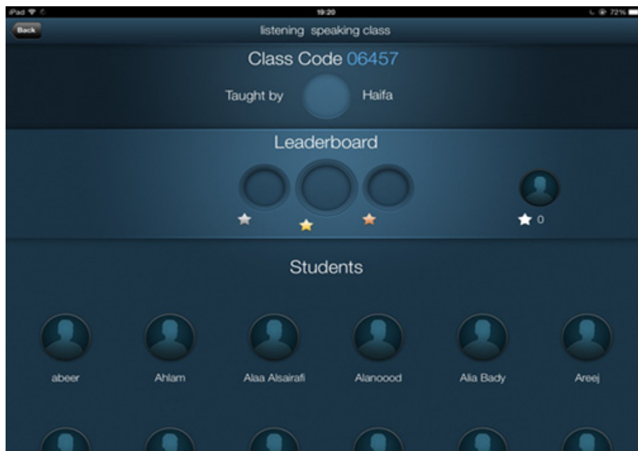
Fig. 1. Screen Capture of Ask3 Virtual Classroom Platform

Phase Three: In the third phase students were divided into groups of 4 and instructed to prepare a 15-minute presentation based on a topic of their choice. This phase utilised the Fuze box application to facilitate discussion and the sharing of ideas amongst learners. They achieved this by setting up online group meetings via Fuze box, where they could receive feedback from their teachers and peers as well as plan and organise their presentation. This phase featured a greater level of confidence and language skill from the learners as they became more familiar with the course.